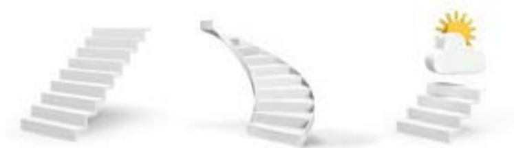
✓ Straight stairs

The T80 platform stair lift is ideal for use on steep slopes and over long distances.